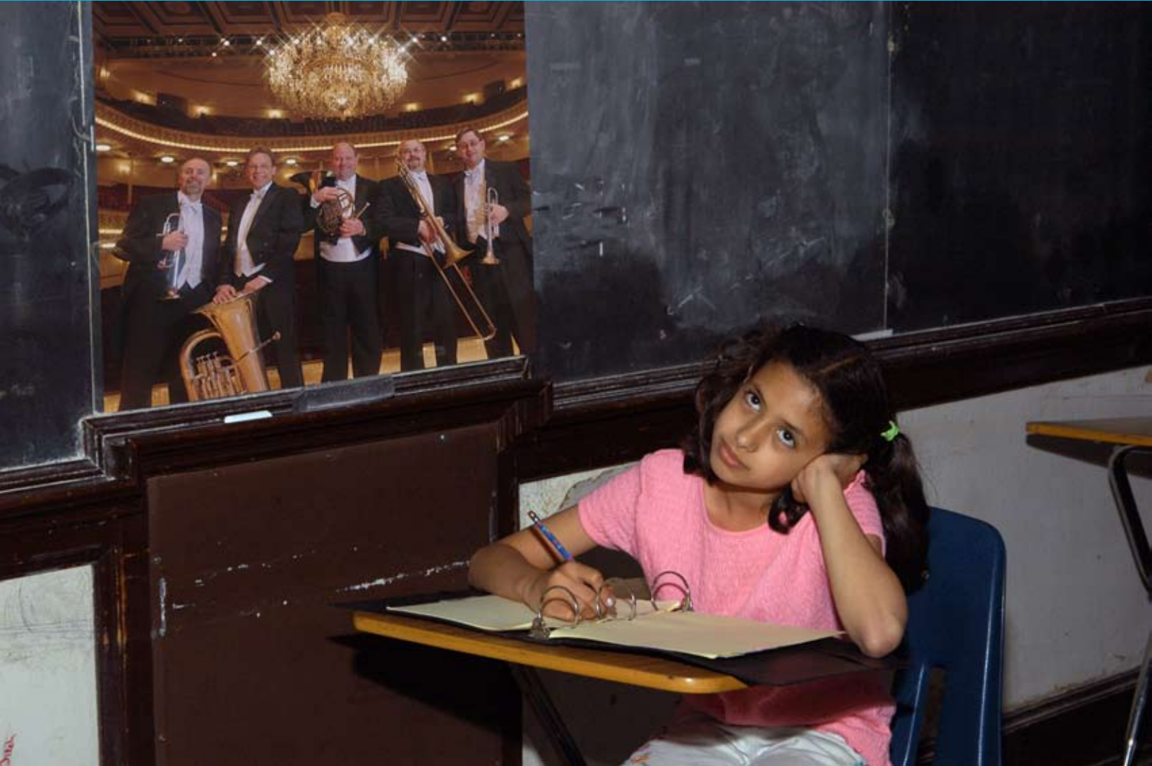
Classroom photo by Rich Sofranko